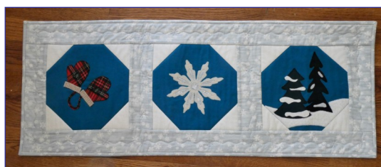
Kathy Veghte. Winter Wonderland, wool applique table runner.